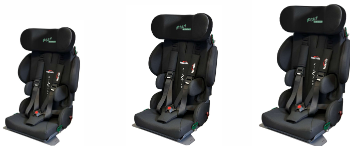
size 1 black (300000-E3)